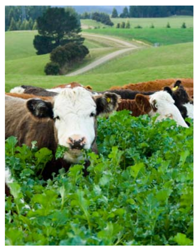
Stock grazing Goliath

Trial was conducted at the Kimihia Research Centre, Canterbury sown 11 November 2008 and harvested 3 February 2009, 30 March 2009, and 7 August 2009.